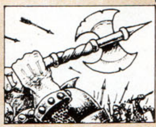
Talisman of Lore