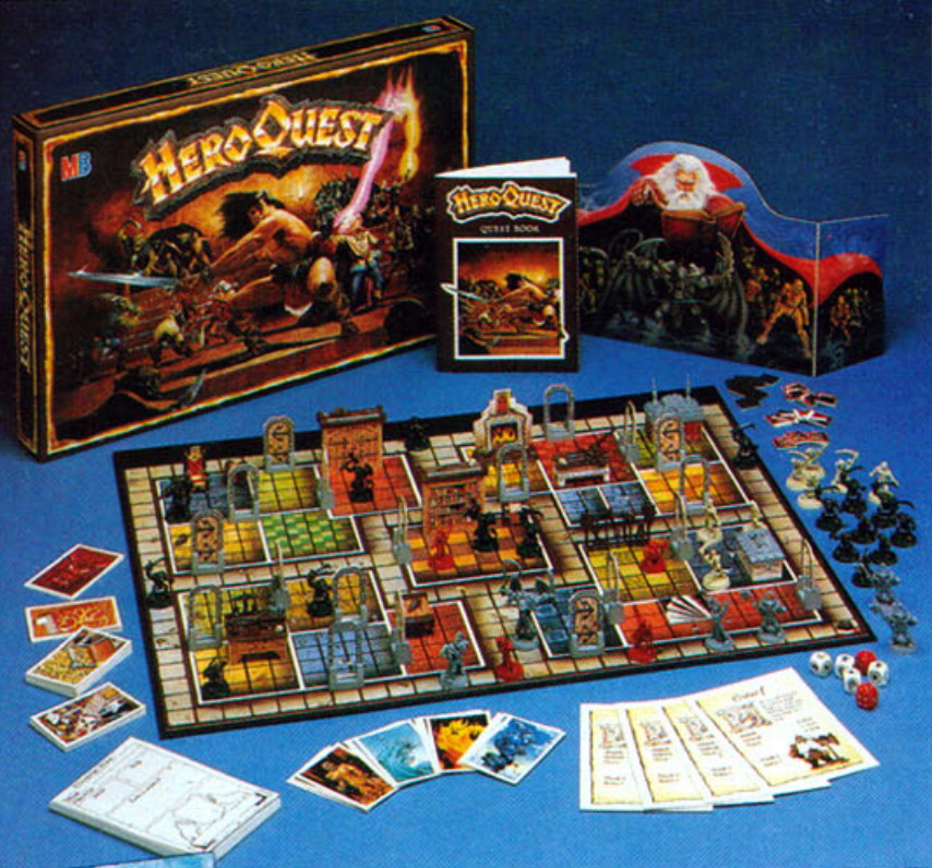
Miniatures supplied unpainted - colours may vary